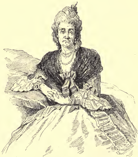
'The Widow Scraggs.'

not unfrequently lecturing young men gratis. Now Sir Ulick O'Shane was a sinner, how then could he please a saint? He did, however—but the saint did not please him—though she set to work for the good of his soul, and in her own person relaxed, to please his taste, even to the wearing of rouge and pearl-powder, and false hair, and false eyebrows, and all the